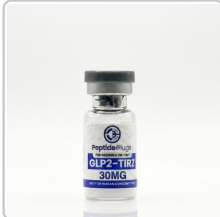
GLP2-Tirz 30mg - 005-B-SM