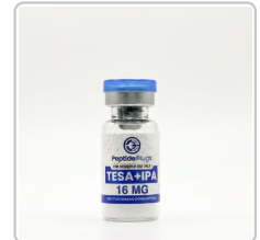
Tesamorelin / Ipamorelin 16mg - 130-01-DK