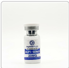
GLP1-Sema 20mg - 125-01-SM