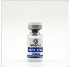
GLP3-RETA 20mg - 124-03-SM