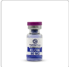
GHK-Cu / TB-500 / BPC-157 / KPV 80mg - 125-02-DK