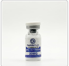
BPC-157 / TB-500 20mg - 128-01-SM